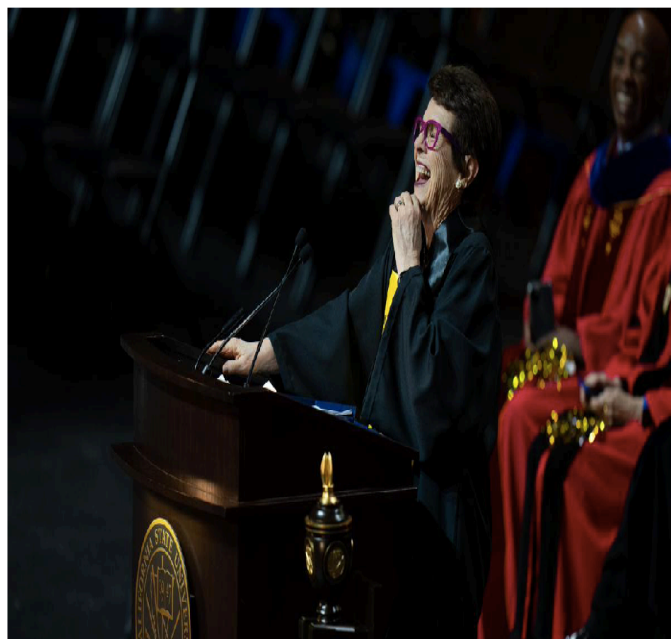
Tennis legend Billie Jean King laughs while delivering remarks before receiving her diploma during California State University, Los Angeles, commencement in Los Angeles, on May 18, 2026.

Tennis icon Billie Jean King earns college degree at 82 The 82-year-old sports and equality icon received her Bachelor of Arts in History from Cal State Los Angeles on May 18. Billie Jean King raised her right arm in triumph. Not for another victory on the tennis court. This time, she was celebrating earning a college degree 65 years after she first took classes. The 82-year-old sports and equality icon received her Bachelor of Arts in History from Cal State Los Angeles on Monday (May 18, 2026), walking across the stage in hot pink glasses and royal blue sneakers at the Shrine Auditorium with about 6,000 others in the Class of 2026.