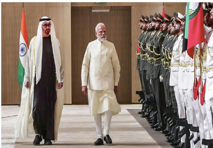
Prime Minister Narendra Modi with UAE President Sheikh Mohamed bin Zayed Al Nahyan during a ceremonial reception, in Abu Dhabi.

PM Modi UAE visit: 'Impact of West Asia conflict being felt globally,' PM tells UAE President. India, UAE sign pacts on defence cooperation, petroleum reserves and LPG supply. Prime Minister Narendra Modi, who arrived in the UAE on Friday (May 15, 2026), held talks with President Sheikh Mohammed bin Zayed Al Nahyan and condemned the attacks on the country amid the West Asia war. "India is ready to extend all possible support to bring peace," PM Modi said. The two countries also signed key pacts over strategic defence cooperation, petroleum reserves and supply of LPG, officials said. Energy security is likely to be a central theme of the discussions, as India monitors rising instability in the Gulf region amid concerns over oil supplies and maritime trade routes.