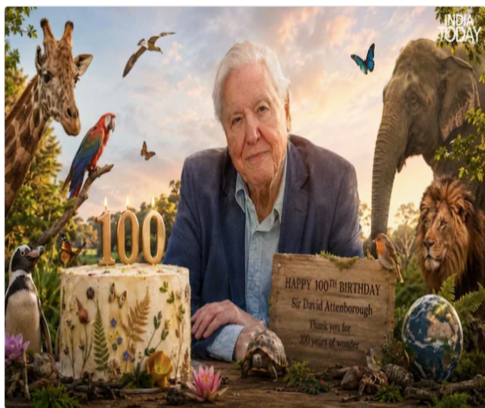
British naturalist sir David Attenborough turned 100 on Friday.

King Charles III and Queen Camilla are among well-wishers to share a birthday message celebrating Sir David Attenborough turning 100. The royal couple also shared photographs of Sir David, including one of him with a young Prince Charles and Princess Anne in 1958, in which he is introducing them to Cocky the cockatoo, from his BBC Zoo Quest TV series. The King and Queen wished him a very happy birthday, adding, "Enjoy your special celebration this evening!". The veteran broadcaster and environmentalist has said he was completely overwhelmed by messages he had received ahead of his big day, which includes a special concert on Friday evening at the Royal Albert Hall in London.