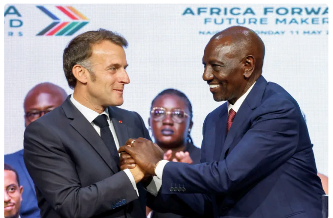
The Africa Forward Summit 2026 in Nairobi. Kenya is France's first significant event on the continent to boost trade ties. Mav

Macron's Kenya visit - France is facing deepening resentment in former African colonies where it once had political influence. France's President Emmanuel Macron has hosted a high-level meeting of heads of state and business leaders alongside his Kenyan counterpart, William Ruto, as Paris continues to pivot to other parts of the continent due to its strained relations with French-speaking West African countries. The conference, which was held on Monday and Tuesday in Kenya's capital, Nairobi, was France's first Africa summit in an English-speaking country. France's Macron announces $27bn investment in Africa at Kenya summit The Africa Forward summit comes amid France's fading ties with its former African colonies, as Kenya seeks greater trade.