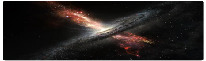
An artist's impression of a galaxy forming stars within powerful outflows of material blasted out from supermassive black holes at its core

A team from the University of Southampton, working with European colleagues, observed the galaxy, more than 12 billion light years away, using state-of-the-art equipment at the European Southern Observatory (ESO) in Chile. "Despite the quasar's extreme luminosity, the black hole at its heart was found to have a mass equal to 'only' around one billion suns," instead of spinning rapidly as expected, the black hole was "belching up" gas, driven outwards by the blinding intensity of light. The black hole at the centre of this young galaxy was first detected in 2024 by Wolf and his colleagues at the Australian National University. The study, published in Astronomy and Astrophysics , used Gravity+, an instrument that combines light from four of the world's largest telescopes at ESO's Very Large Telescope in Chile. The team, which also included researchers from France, Germany, Portugal and Belgium, analysed the hot gas spiralling into the black hole