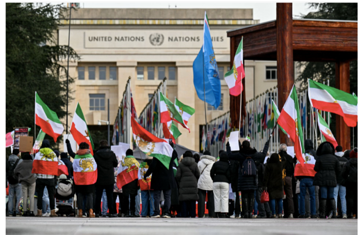
Protesters hold Iranian pre-Islamic revolution of 1979 flags in front of United Nations office ahead of indirect nuclear talks

Iran students stage first anti-government protests since deadly crackdown: Students at major Iranian universities, including Sharif University of Technology, Amir Kabir and Tehran University, have launched new anti-government protests marking the start of a new semester. These demonstrations are in response to a violent crackdown in January 2026 where thousands were killed. The students shouted "Death to the Dictator" and "Death to Khamenei", condemning the Supreme Leader. Protests involved marches, sit-ins and clashes with the Basij militia.