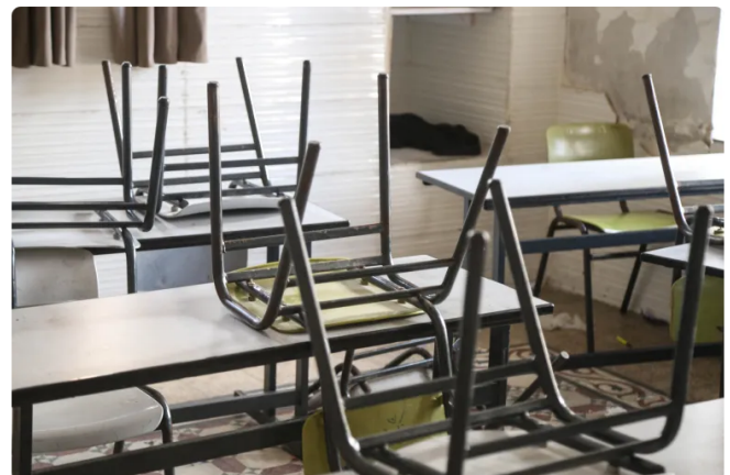
The Zenabia Elementary School in Nablus has been forced to operate on a three-day-per-week schedule due to funding cuts brought on by Israeli policies

Under the direction of far-right Finance Minister Bezalel Smotrich, Israel has systematically been withholding billions of dollars in tax revenues over the past two years that Israel collects on behalf of the Palestinian Authority (PA). The measure is partly intended to punish the PA for its longstanding policy of paying families of Palestinians imprisoned by Israel for resisting the occupation – even after the PA announced early last year that it was reforming such policies.