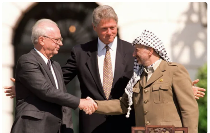
The famous 1993 White House lawn handshake between Israeli Prime Minister Yitzhak Rabin (left) and the Palestinian President Yasser Arafat (right), with United States President Bill Clinton in the centre

Oslo Accords figure deeply linked to Epstein network. New documents reveal Terje Rod-Larsen facilitated visas for Jeffrey Epstein's victims and was listed for a $10m payout, prompting Palestinians to question whether the peace process was engineered by blackmailed diplomats.