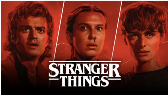
'Stranger Things' Season 5 Netflix

The final season, Stranger Things Season 5, is already on the cards, and fans can expect a whole lot of emotional farewells and an ultimate conclusion. The season will try to live up to the friendships and spirits that made Stranger Things so universally adored.