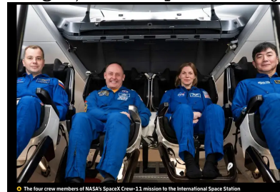
The four crew members of NASA's SpaceX Crew-11 mission to the International Space Station

Astronauts undergo rigorous medical screening before selection. They are assessed for conditions that might worsen in microgravity, evaluated for psychological resilience, and monitored throughout their careers. ISS doesn't have a "rescue vehicle" at its disposal, but it's guaranteed that at least one vehicle, either a Soyuz capsule designed by Russia or, as of recent developments, a SpaceX Crew Dragon, remains permanently docked to it.