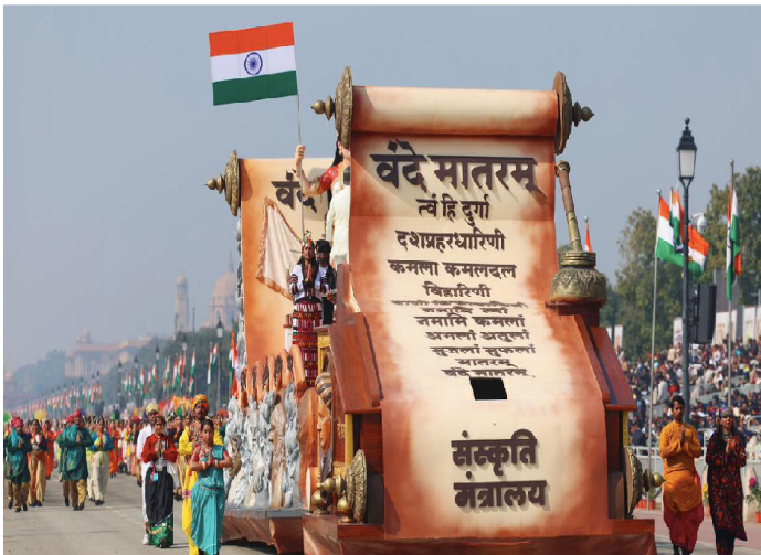
A view of the Ministry of Culture tableau during the 77th Republic Day Parade, in New Delhi on January 26, 2026.

Prestigious and illustrious awards namely the Padma Awards, Gallantry awards, and Service Medals were announced and included national luminaries from cinema, sports and social service.