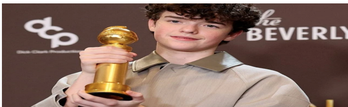
Owen Cooper, winner of the Best Performance by a Male Actor in a Supporting Role on Television Award for "Adolescence" poses in the press room during the 83rd Annual Golden Globe Awards at the Beverly Hilton on January 11, 2026 in Beverly Hills, California.

Television winners were equally notable. The limited series Adolescence emerged as one of the biggest winners of the night, taking home Best Limited Series. Overall, the winners of the Golden Globe Awards 2026 reflected an industry embracing diversity, innovation, and strong storytelling. By recognising outstanding performances and celebrating films and series from around the world, the ceremony captured a defining moment in modern entertainment.